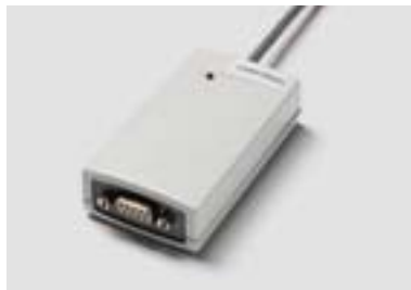
Serial interface (R 232) for additional control, with memory function.